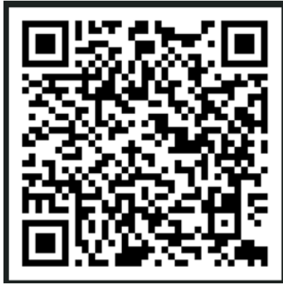
QR 1 – STPN Guideline